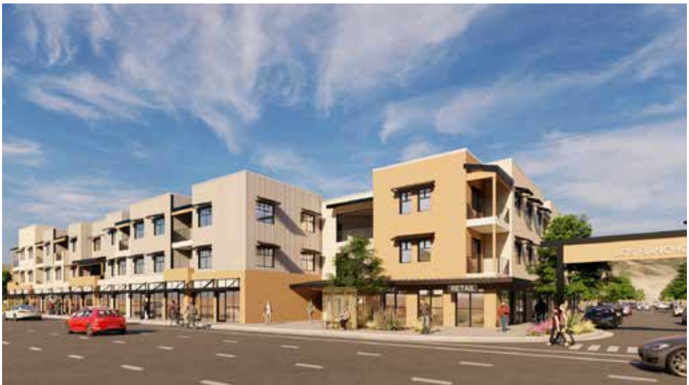
Image: View from 4th street - microretail shops at the base and residential dwelling units above.