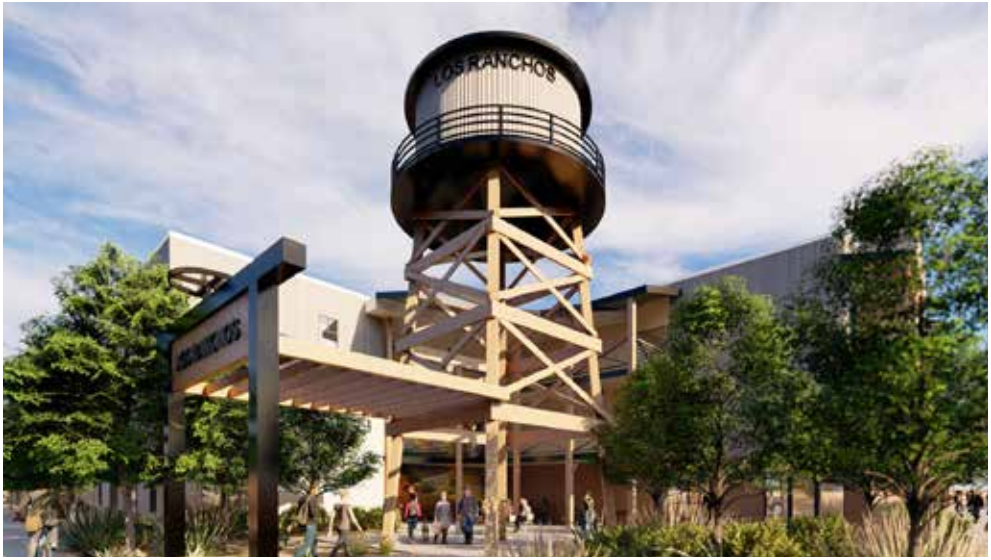
Image: View of the community from the corner of 4th and Osuna. Site entry compuerta welcoming the greater community and iconic water tower defining the corner.