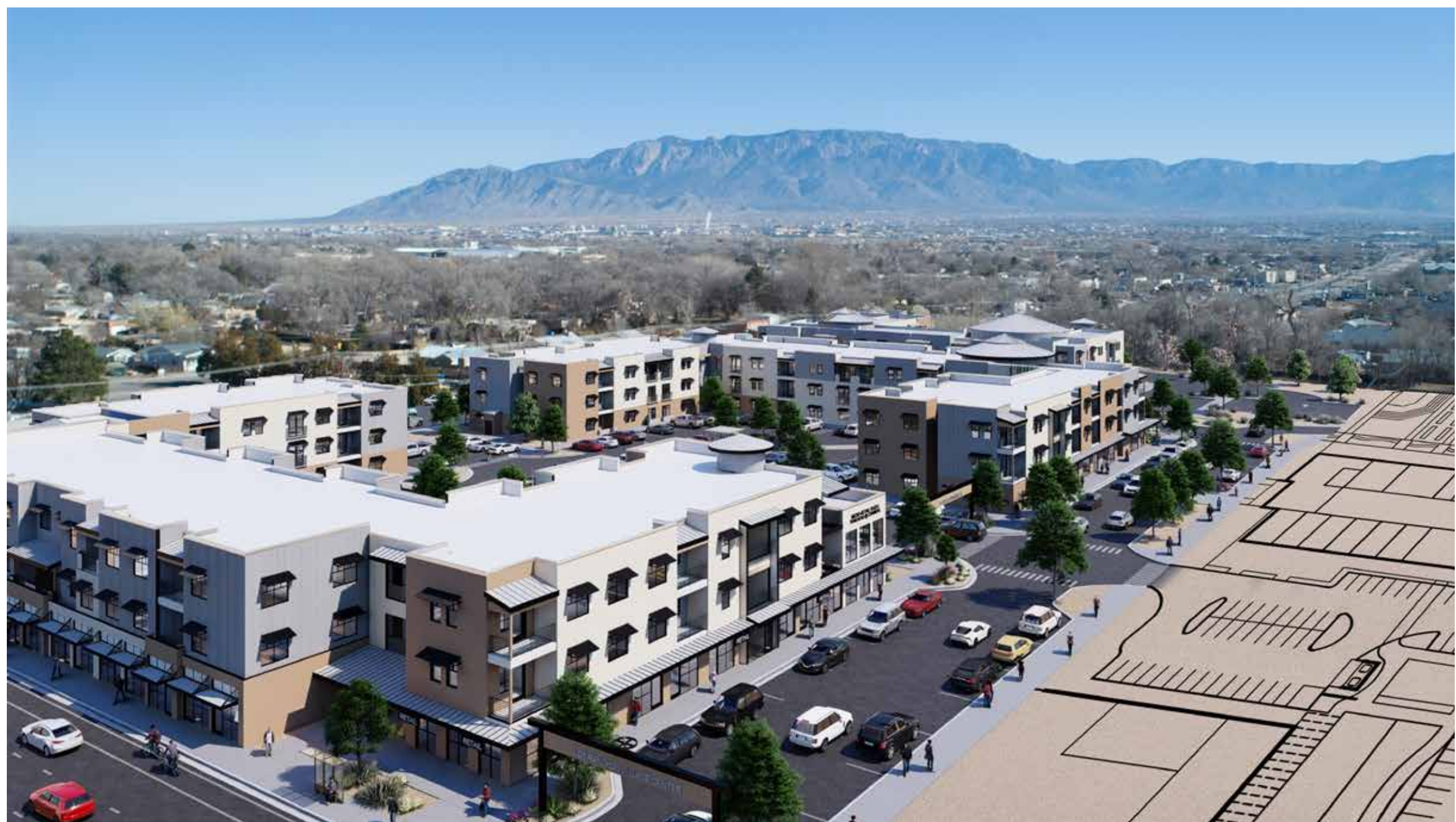
Image: View of the main entrance and leasing office from the south, looking northeast.