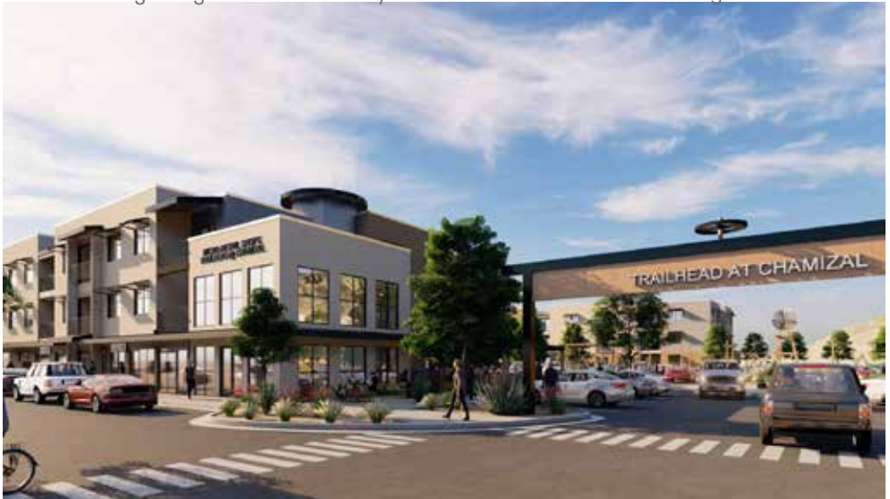
Image: View of the southside of the community, microretail shops at the base and residential dwelling units above. Entry icon - compuerta - greeting residents.